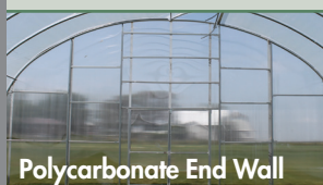
Polycarbonate End Wall