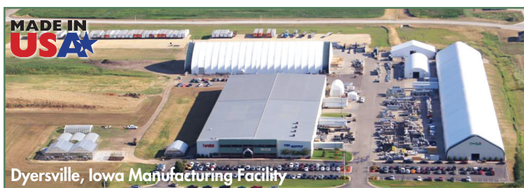
Dyersville, Iowa Manufacturing Facility

Since 1979, Growers Supply has offered cost-effective, versatile and energy-efficient greenhouses and provided the highest-quality products at the most economical prices to the growing and agriculture industry. We provide in-house design, manufacturing and construction, and pride ourselves on offering superior customer service; that's why our experienced greenhouse specialists are highly trained to help you determine the best greenhouse and setup for your needs.