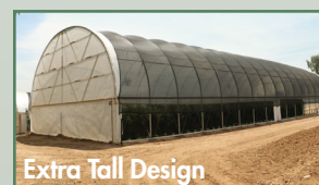
Extra Tall Design