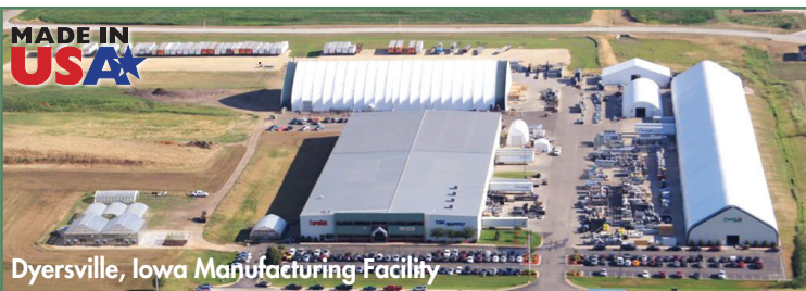
Dyersville, Iowa Manufacturing Facility

Since 1979, Growers Supply has offered cost-effective, versatile and energy-efficient greenhouses and provided the highest-quality products at the most economical prices to the growing and agriculture industry. We provide in-house design, manufacturing and construction, and pride ourselves on offering superior customer service; that's why our experienced greenhouse specialists are highly trained to help you determine the best greenhouse and setup for your needs.