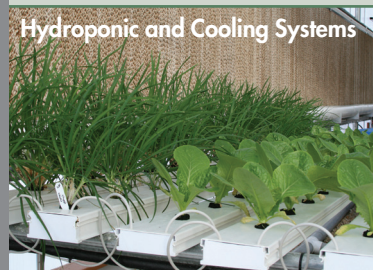
Hydroponic and Cooling Systems